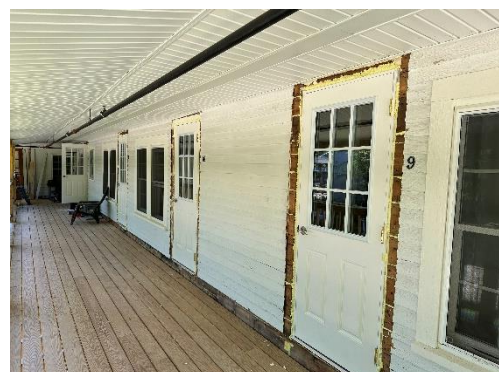
7 New exterior doors have been installed so far.