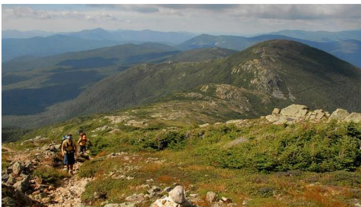
On Crawford Path the Hiking Season has begun.